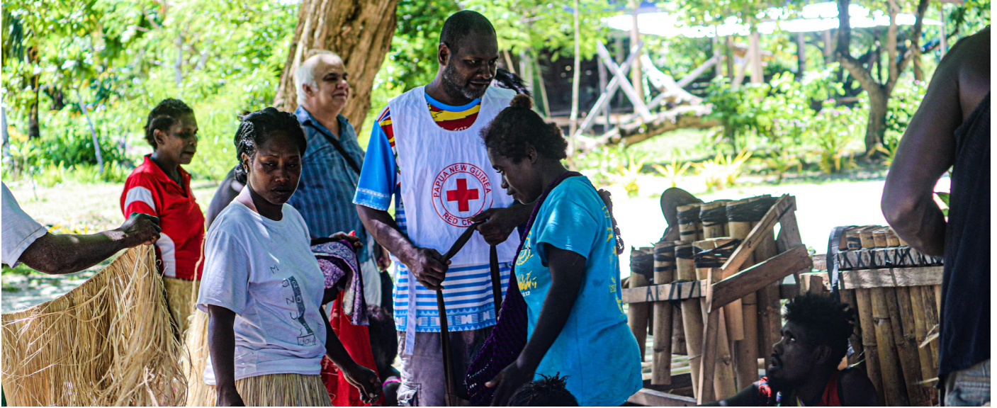
Volunteers from PNG Red Cross from and ENB Branch during the one week peer to peer exchange program.

Buka, AROB. In the lead up to the World Red Cross Day the Buka and Kokopo branches of the PNG Red Cross took part in a first of its kind peer-to-peer exchange program in Buka last week. The program aimed to enhance the operational capacities of both branches by facilitating the exchange of ideas and information between volunteers.