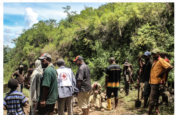
Local men from the lumusa community fixing the road