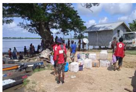
PNGRCS and ESP PDC leaving Kambramba after NFI distribution.

Yellow route depicts travel from Angoram to Kambramba on river crafts. Black line depicts Main Sepik River. Red line Arrow depicts flow of Sepik River. Black Dimensional Arrow points tributary to Kambramba. Light blue 2D arrow distribution point.