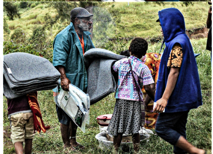
Community members from the Wurup receiving the Relief items provided by the PNGRCS