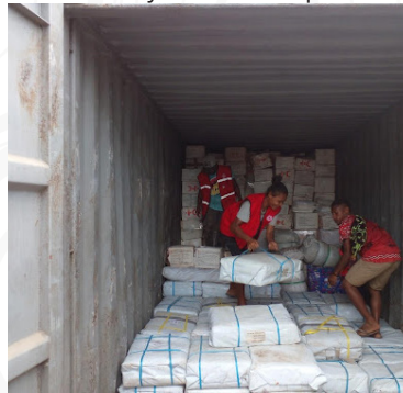
Madang Branch volunteers unloading NFI's to respond to the Sepik Earthquake

Keram LLG and Yuat LLG, the two areas that were most affected by the earthquake