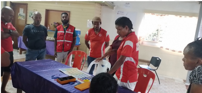
Volunteers from PNGRCS Alotau Branch actively taking part in the BOCA workshop

Papua New Guinea Red Cross Society in its mission to build disaster preparedness and resilient communities, is conducting IVCA workshops for selected communities in 3 provinces in PNG.