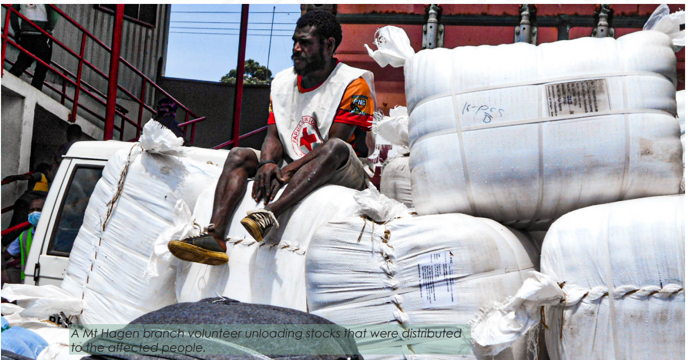
A Mt Hagen branch volunteer unloading stocks that were distributed to the affected people.