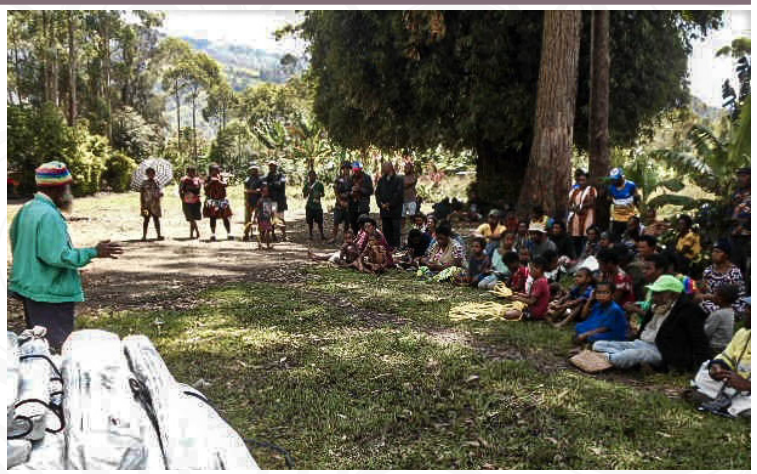
PNGRCS volunteers from Mt Hagen Branch doing the distribution of NFI's to identified families that were affected by the conflict