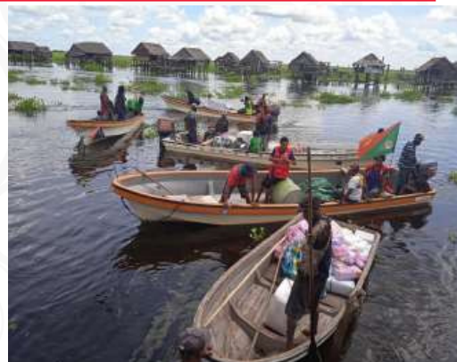
PNGRCS and ESP PDC leaving Kambramba after NFI distribution.