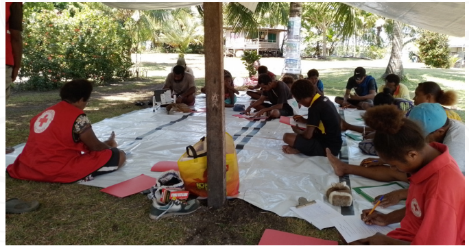
Siar community members taking part in the IVCA Workshop

The PNG Red Cross through the Red Ready Project has been conducting this assessment to our branches. Even though it was a refresher for the branch there were a lot of new volunteers who took part in the assessment to assess where they are in order to improve and develop their capacity.